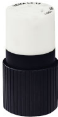
Locking Female Connector Body.