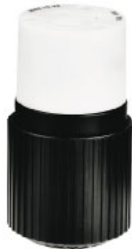
Locking Female Connector Body.