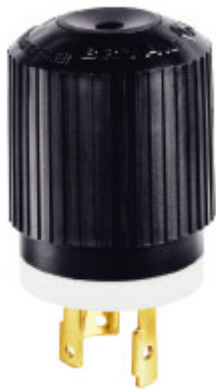
Locking Male Plug.