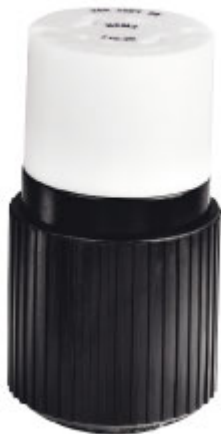
Locking Female Connector Body.