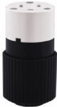
Straight Blade Connector.