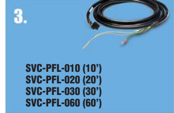
SVC-PFL-010 (10') SVC-PFL-020 (20') SVC-PFL-030 (30') SVC-PFL-060 (60')