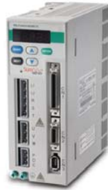
Servo Drive SVA-2040