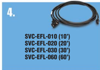
SVC-EFL-010 (10') SVC-EFL-020 (20') SVC-EFL-030 (30') SVC-EFL-060 (60')