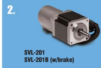
SVL-201 SVL-201B (w/brake)